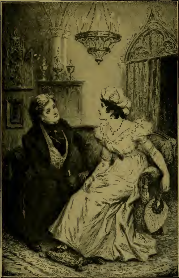
We spent about an hour in familiar talk